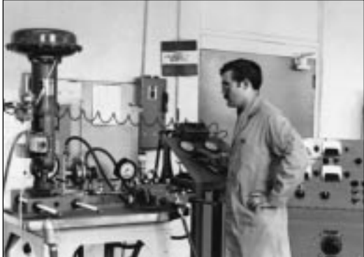
During performance tests of Pneumatic Activated Valves, spring loads are adjusted (for fail-safe valves) and limit switches are set.