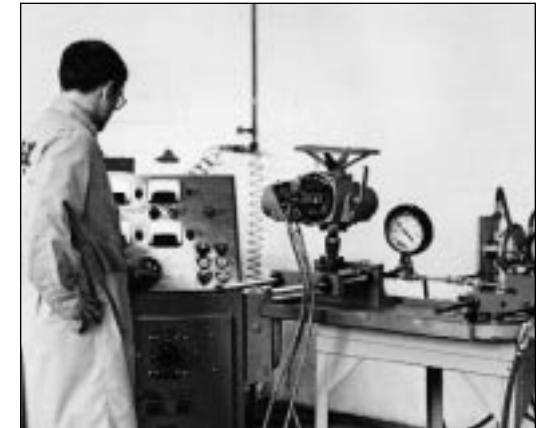
Vogt motor operated valves are shell and seat hydrotested utilizing the valve actuator to develop open and closing torques.

Limatorque—a product of Limatorque Corporation.