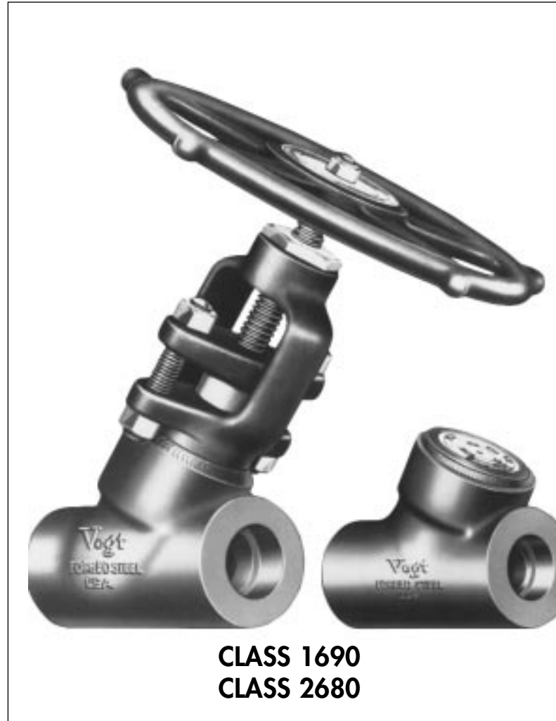
CLASS 1690 CLASS 2680